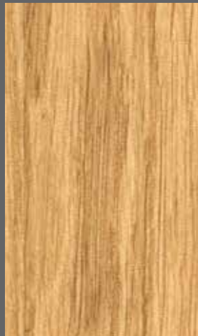
Rustic Oak | WSA2006 WR340 / A1M340 / LRV 37