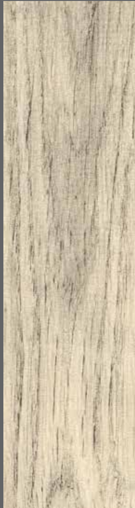
Ranch Oak | WSA2021 WR335 / A1M335 / LRV 51