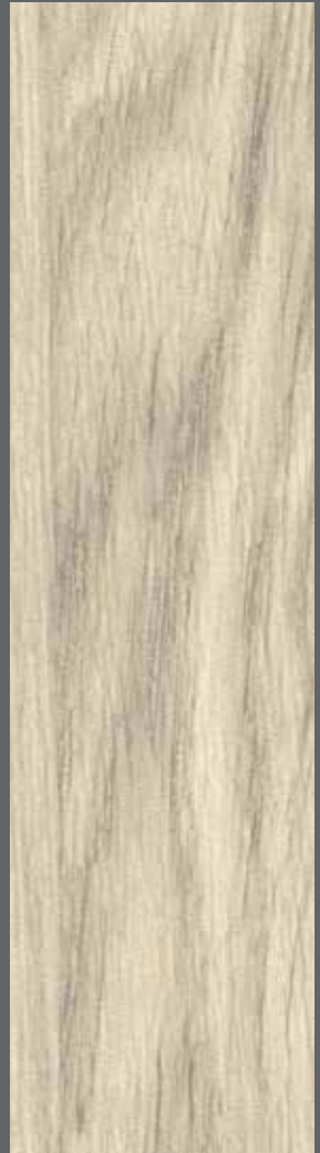
Bleached Oak | WSA2001 WR335 / A1M335 / LRV 52