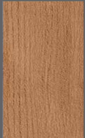
Spring Maple | WSA2018 WR352 / A1M352 / LRV 27