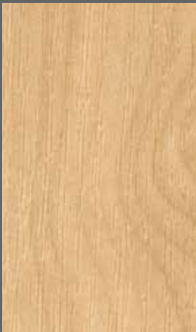
Light Beech | WSA2017 WR462 / A1M462 / LRV 43