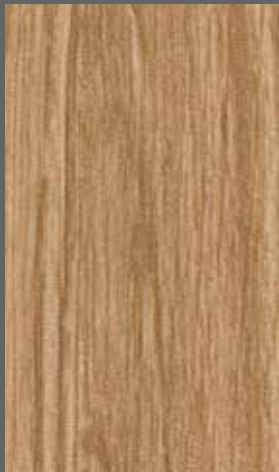
Oak Traditions | WSA2013 WR353 / A1M225 / LRV 25