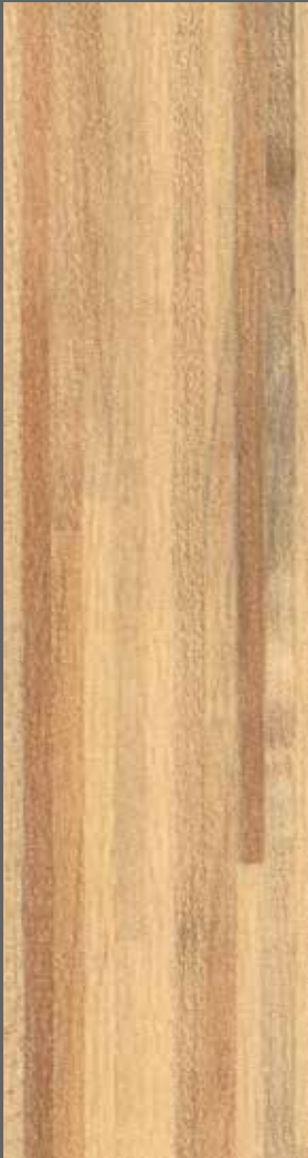
Washed Bamboo | WSA2020 WR463 / A1M392 / LRV 42