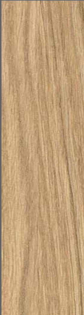
Farmhouse Oak | WSA2004 WR338 / A1M27 / LRV 38